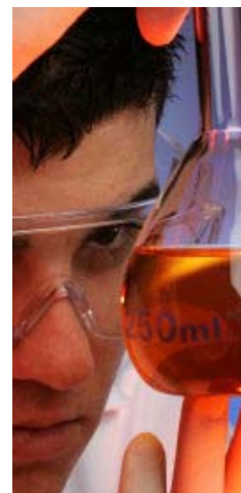
Scientists Were Immediately Amazed At What This Plant Can Do