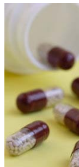
Only A Handful Of Hoodia Products Have Enough P57 To Kill Your Hunger

Which is why real Hoodia - the kind that thrusts a dagger through the heart of the most demanding hunger monster - is nearly impossible to find.