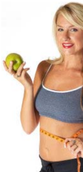
The Power To Control Your Appetite

Well, it's time to take another look at this ugly little plant. Because the research shows that it can stop your hunger cold.